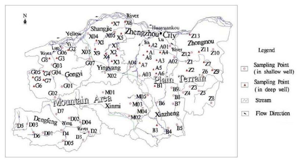
Fig. (2): - Location of sampling points.

The data matrix was divided into two groups to determine the various classes of groundwater quality. Group I include the points D03, G06, X03, D04, M01, A02, and GB00. Group II includes the rest 70 sample points. Apparently, the shallow groundwater of group I is not drinkable. As there is no samples from deep confined water at group I area, we provisionally assume that the deep confined water is non-polluted good quality water.