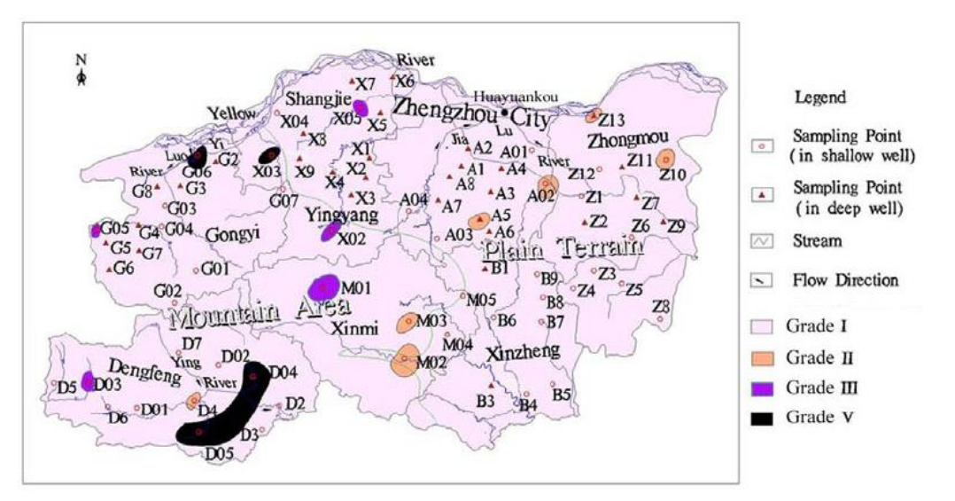
Fig. (3): - Classification of shallow groundwater quality

The values of normalized weight factors have been used to build weight matrix A. After building A and R, we then chose the operator (\cdot, \oplus) , which is the weighted and summing operator to obtain the fuzzy synthetic evaluation results. This operator may weaken the function of the main factors, but it can make full use of the information. The results of fuzzy math were employed to establish a classification map for the groundwater quality in Zhengzhou city. This was achieved by applying MAPGIS (a Chinese version of GIS developed by the China University of Geosciences). The map will furnish a more direct and simple way to analyze and explain the water quality data (Figure 3).