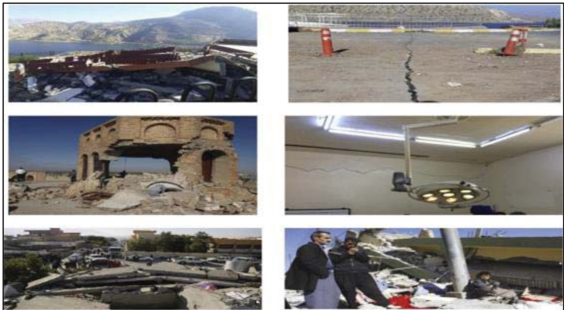
Figure (1.3): Damages to different structures in Iraq due to the Halabja earthquake, 2017 (after Al-Taie and Albusoda, 2019).

In the last few decades, most researchers have undertaken the fundamental characteristics of foundations under dynamic loads, but the study of the behavior of shallow foundations and deep foundations under earthquakes has little been reported. According to the above-mentioned problems, the experimental work and numerical model of the raft-soil system and the pile-soil system will be built in this study with FEM PLAXIS-3D , and their dynamic response will be analyzed by inputting Halabjah, Ali-Gharbi, and El-Centro seismic waves.