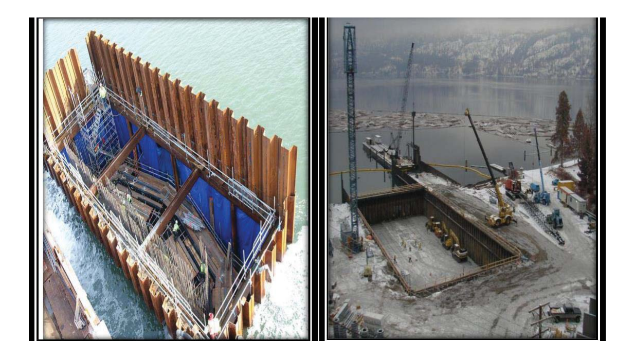
Figure (1.1): Sheet piling wall (design buildings, 2017).

According to the manner of construction, the sheet piles could been divided into two categories: those that were first driven into the ground and then backfilled, and those that are first driven into the ground and then scoop up the earth behind the mound. In either scenario, the soil that is backfilled behind the sheet pile wall is typically granular, and the soil that lies below the dredge line might be either sandy or clayey ( Bowles,1996 ).