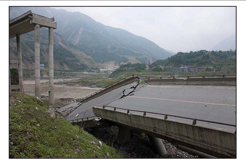
Figure (1.4): Collapsed of Kahramanmaraş Bridge in Turkey earthquake 2023 (National Earthquake Information Center).