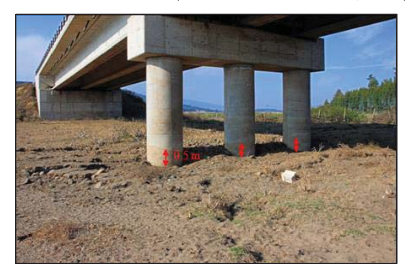
Figure (1.3): Soil settlement at interior pier at Mataquito Bridge (Gutierrez and Ledezma, 2017).

In addition, settlement of the soil around the interior piers was also observed, see Figure (1.3) and appeared to be partly due to lateral spreading of the soil down the slope as well as to weakness of soil that caused settlement under the foundations (Gutierrez and Ledezma, 2017).