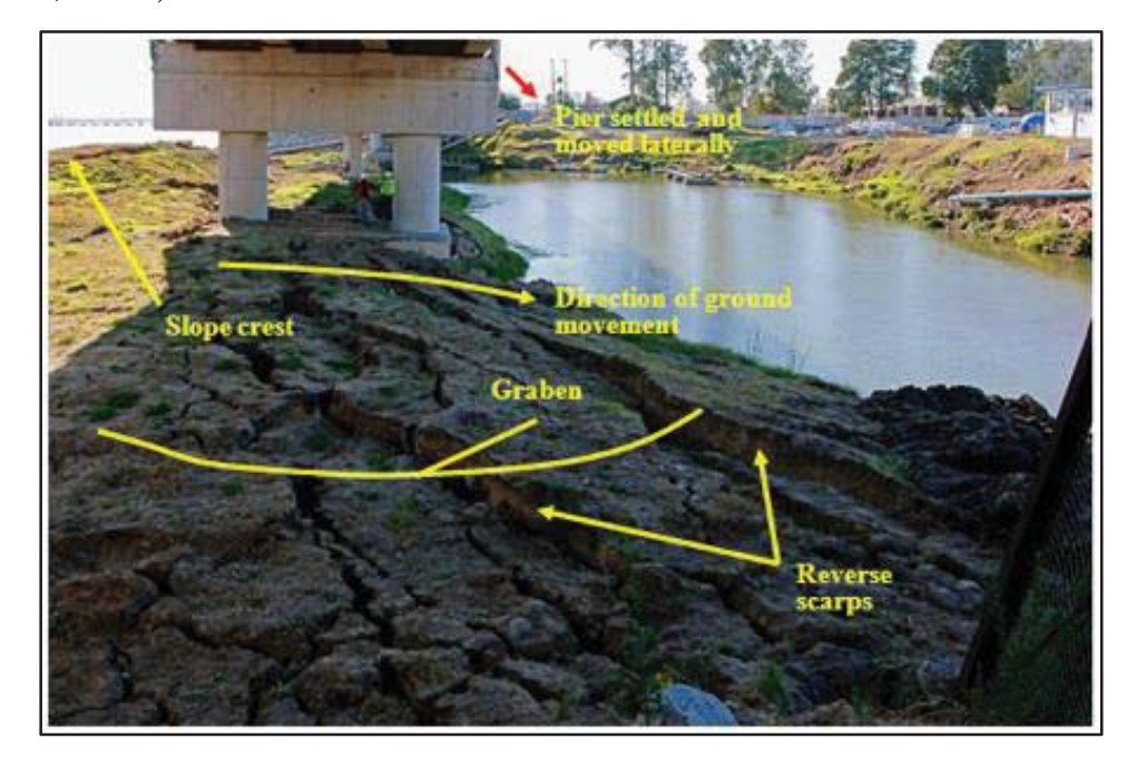
Figure (1.1): Ground failure at bridge foundation (Gega and Bozo, 2017).

seismic wave which strike the sloped soil mass and make it slightly unstable. Therefore, to construct a safe structures in a slope ground must prepared a careful and complete study to reduce the failure chance. Figure (1.1) shows the ground failure occurred due to an earthquake loading. This type of failure can cause great damages to bridges due to the lateral soil moving (Gega and Bozo, 2017).