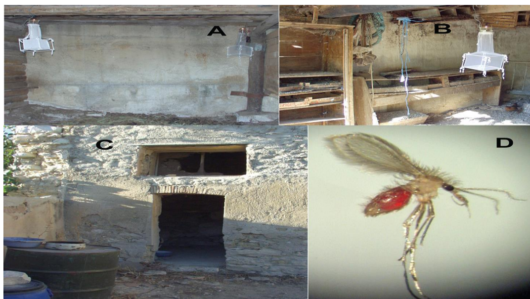
Figure 2 Shows light traps for catching sand flies (A), beside rabbit pens (B), in shady areas inside human housing (C), and an engorged female P. perniciosus sand fly (42).

between the Eastern and Western Mediterranean basin states (41).