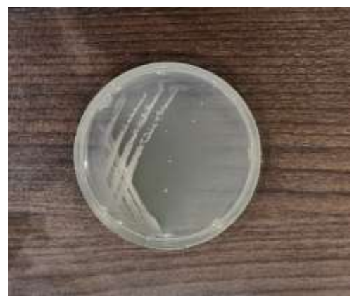
Figure (3): Candida albicans on sabouraud dextrose agar medium to be incubated for 48h at 37 °C.

Candida albicans appearance on sabouraud dextrose agar medium is presented in (Figure 3). MIC determination using a disposable sterile plastic contains 96 well, well 12 served as the negative control, while well 1 acted as the positive control as presented in Figure (4).