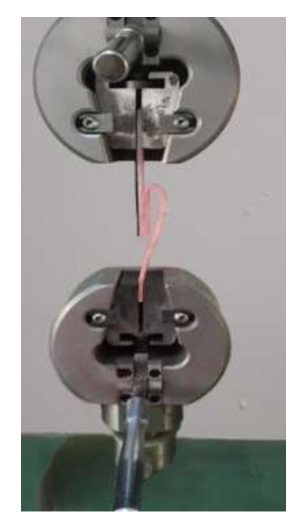
Figure (2): Peel bond strength test.