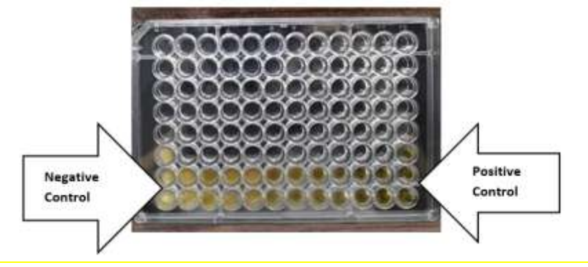
Figure (4): Minimum inhibitory concentration (MIC) determination using a plastic container that contains 96 wells.