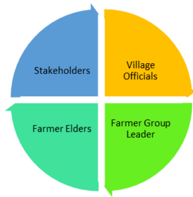
Figure 1. Key Respondents

(Miles, Huberman and Saldana, 2014), the process is shown in Figure 2.