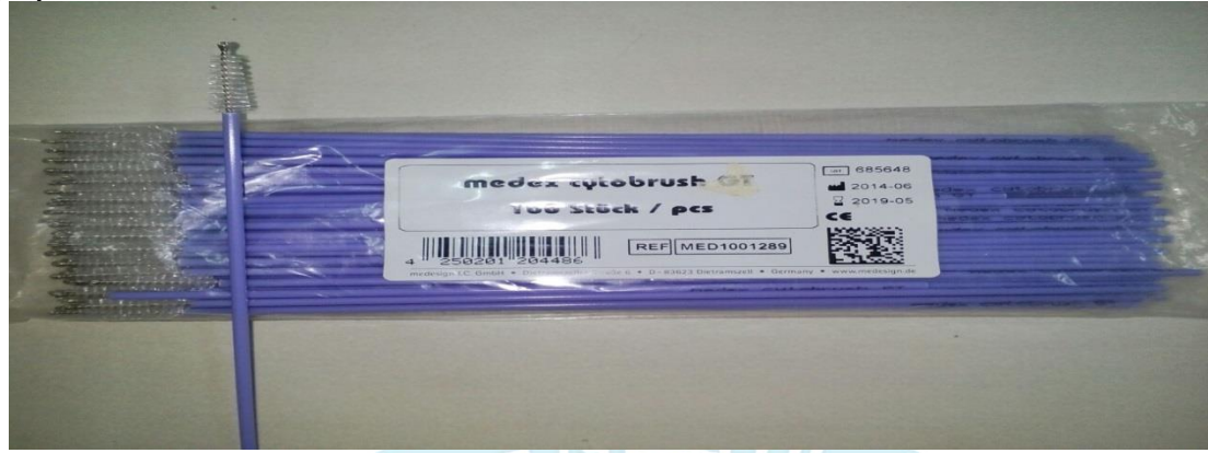
Figure 1: Cytobrush used to obtain endometrial cytological samples.