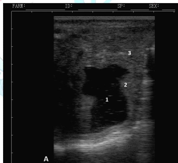
Fig. 1 : Ultrasonographic image of endometritis(A) before treatment (probe 6.5 MHz; depth 9 cm). 1: Purulent uterine content; 2: Endometrium; 3: Myometrium.

In our study , figure (1) show the ultrasound technique to diagnosis endometritis in cows that help the vet.practitioner more than rectal palpation ,this figure explain the disturbution of echogenic and unechogenic views to determin the endometritis of cow uterus.