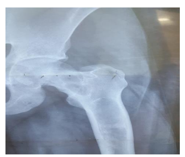
Figure (2): Unicameral bone cyst in the femur neck and subtrochantic area in the mature patient.

Figure (1): Pre-operative X-ray of unicameral bone cyst in calcaneus.