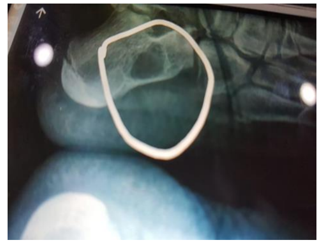
Figure (1): Pre-operative X-ray of unicameral bone cyst in calcaneus.