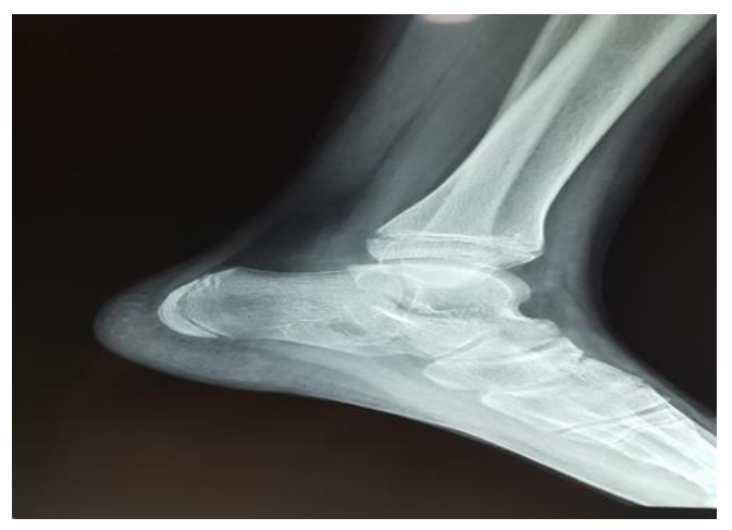
Figure (4): Post – operative X – ray, 45 days after treatment.

The result of histopathological examination of UBC biopsy was confirmed the cyst to be SBC by appear the area have fibrous membrane, spindle cells and occasional cells.