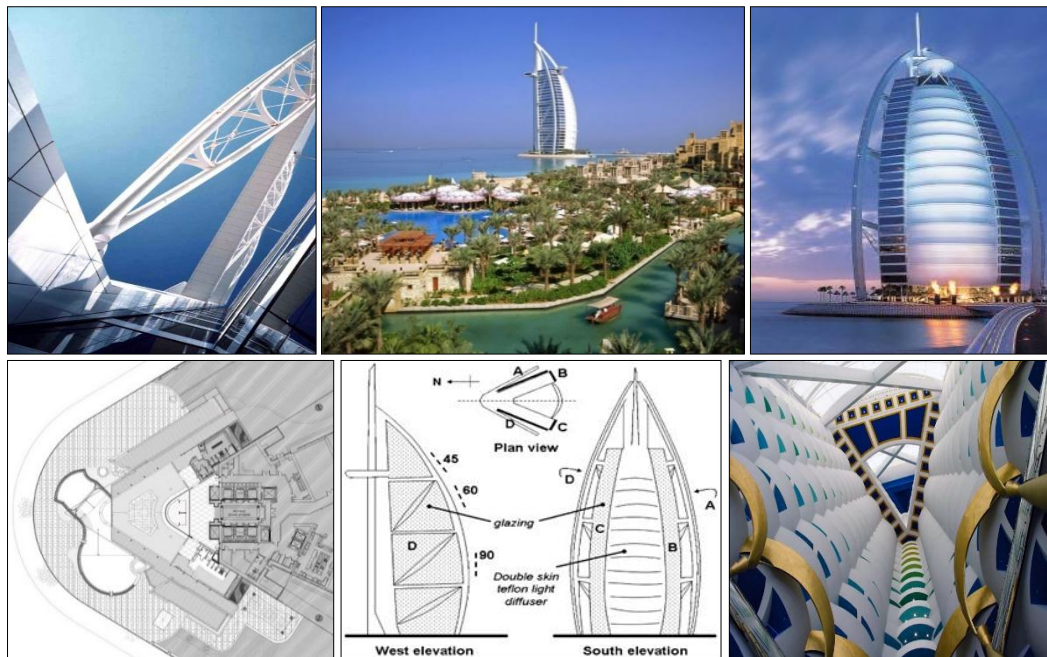
Figure 1: Images for Al Arab tower Building in Dubai [27].

meanings. The hotel was built on a triangular artificial island, about 300 meters away from the land and connected with it by the bridge [25]. The building undoubtedly served as a cultural symbol that represents the interrelationship between global, western, technological and contemporary values on the one hand, and a reference to a part of the heritage of the region on the other, and a new custom that replaced old customs and took its place [26]. Figure 1 shows photos for Al Arab tower in Dubai