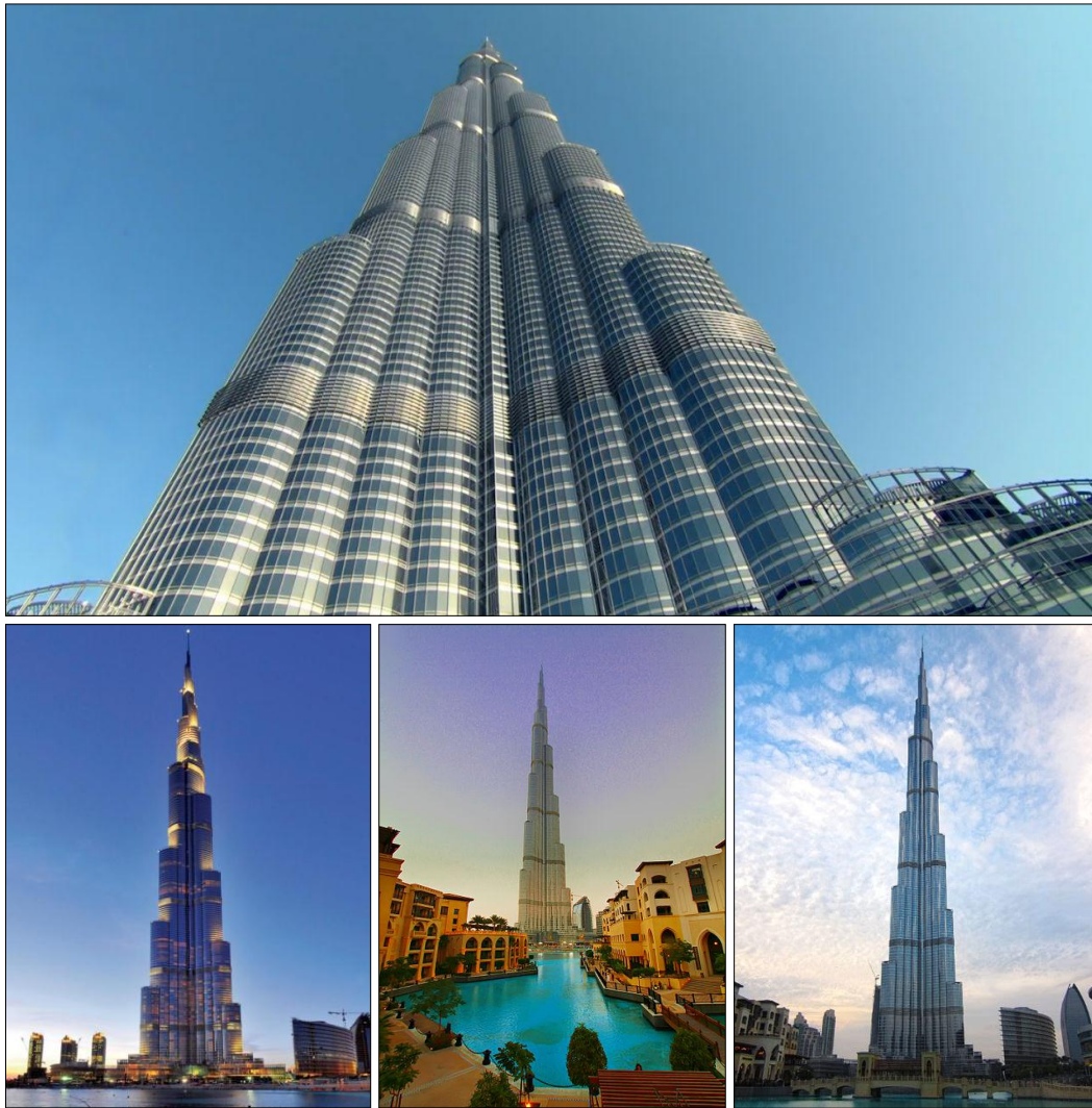
Figure 2: Photos for Khalifa Tower in Dubai [27].