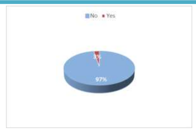
Figure (1): The percentage of cases who required hospitalization

About the outcome only one dead healthcare mortality rate Figure (2). worker which constitutes (0.5%)