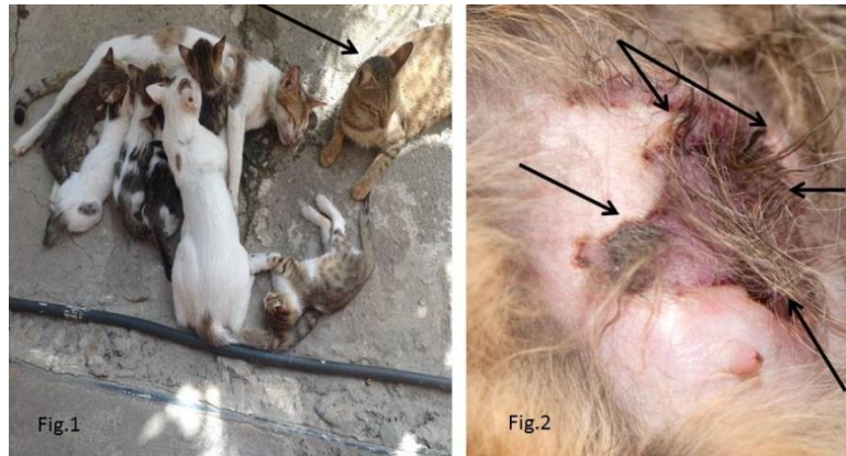
Figure 1. Shows the sick queen that neglected her kitten